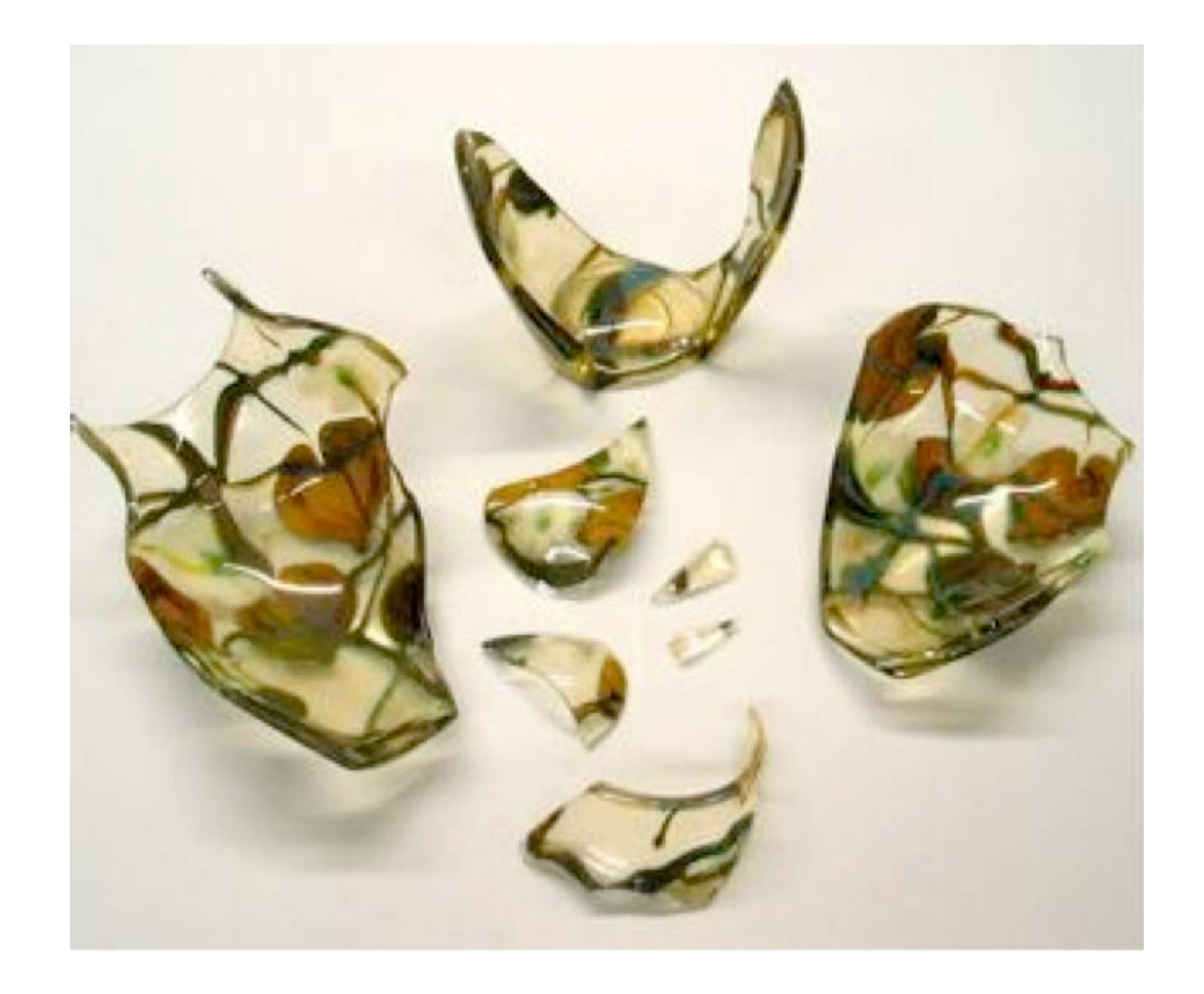
"The PDP is broken ... "