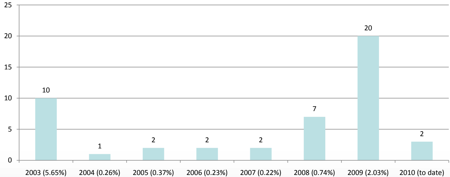
46 Registrars Terminated or Non-renewed 2003 - present