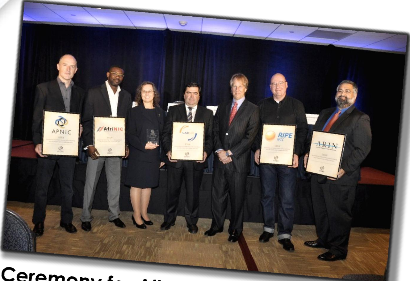
Ceremony for Allocation of Last Five /8s