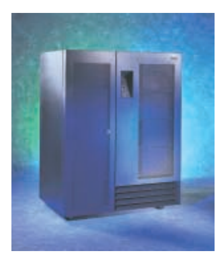
IBM TotalStorage Enterprise Storage Server