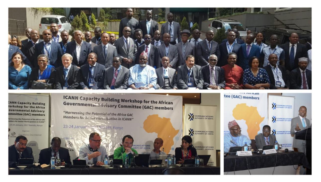
ICANN | Five Years of Africa Strategy Implementation | February 2018

ICANN held the first capacity building workshop for the Africa Governmental Advisory Committee (GAC) members on 23-24 January 2017 in Nairobi, Kenya in cooperation with GAC Under-served Regions working group (USRWG). The workshop, themed "Harnessing the Potential of the Africa GAC Members for better Participation in ICANN" was held with the support of the Communication Authority and the Government of Kenya.