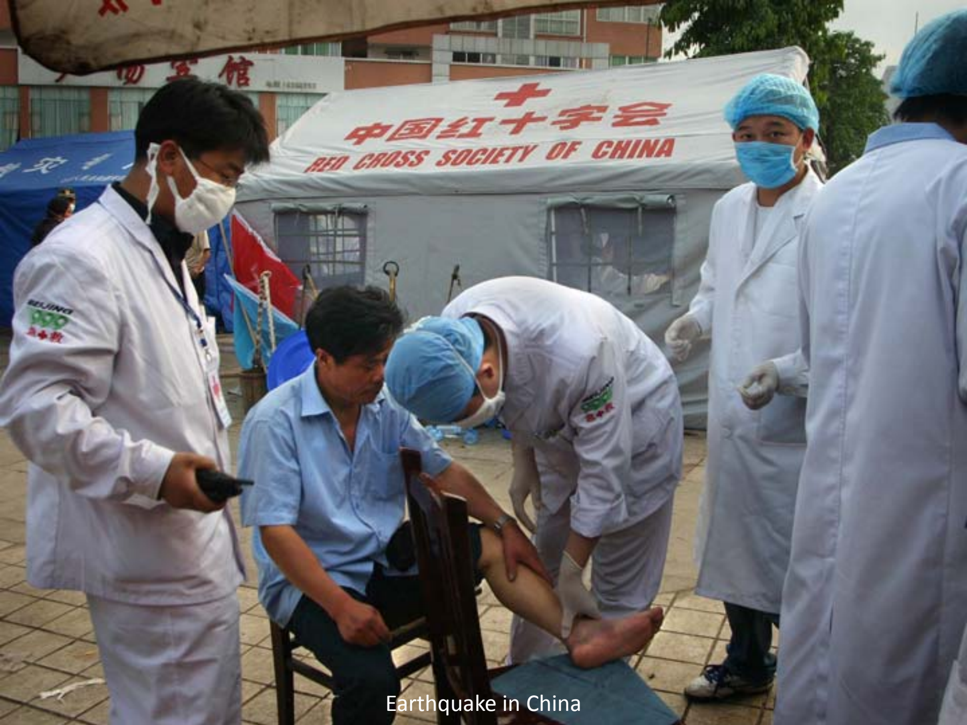
Earthquake in China