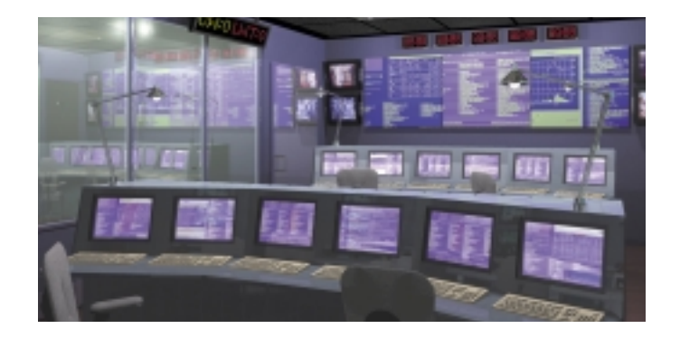
To take a virtual tour of our Internet Data Centers, visit our web site at: www.ipservices.att.com/datatour

AT&T Enterprise Hosting Services is also designed for flexibility. It is engineered to allow for the "sharing" of management capabilities. If needed, you may assume control over administrative functions of the equipment or industry-recognized software, or bring in proprietary equipment or software. Or, you can ask AT&T to assume control over administrative functions of the equipment or industry-recognized software and/or proprietary equipment or software. With the blending or sharing of the management elements, AT&T provides maximum flexibility, with security and reliability, in managing your hosted e-business application. The flexibility of the service does not end there. You also receive Internet (front-end) connectivity via a burstable WAN access method to the AT&T Global IP Backbone. Connectivity is configured to meet your individual needs and is burstable, allowing you to exceed your minimum Committed Information Rate (CIR). A full suite of administrative (back-end) connectivity options is also available. AT&T Internet Data Centers are directly connected to our high-speed packet and dial networks, allowing quick and cost-effective